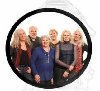
La famille Campagne

Tickets/billets: adult $50 adulte student $25 élève 12 & under free/ 12 ans et moins gratuit