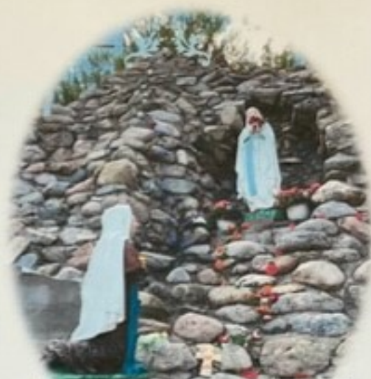
The Eucharist bathes the tormented soul in light and love. Then the soul appreciates these words, 'Come all you who are sick, I will restore your health.' St. Bernadette Soubirous

7:00 – Eucharistic Adoration – Hymns, Divine Mercy Chaplet, Silence & Benediction (Novena to Our Lady of Lourdes - the novena will begin on August 1<sup>st</sup> and concluding prayers will be on the 10<sup>th</sup> at the church Follow our FACEBOOK OR WEBSITE page for novena details)